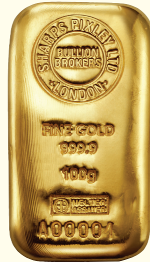
100g Sharps Pixley Ingot Purity: 99.99% VAT-free