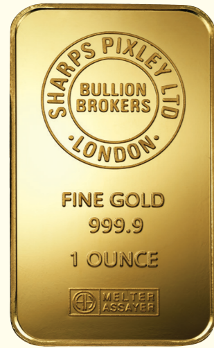
1oz Sharps Pixley Bar Purity: 99.99% VAT-free