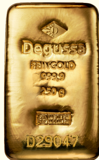
250g Degussa Ingot Purity: 99.99% VAT-free