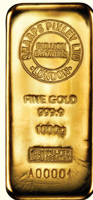
1,000g Sharps Pixley Ingot Purity: 99.99% VAT-free

Please note it is not possible to hold silver, platinum, palladium or gold coins within your pension.